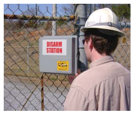
A disarming system allows entry for utility personnel and approved contractors, but keeps copper thieves out.

traditional keypad arming station is often too cumbersome to implement. Simply distributing and managing the disarm codes can be difficult. Kemp and Duke Energy developed a custom disarming station that provides security but doesn't impact existing processes. USA Security places a small call box near the entrance of a substation or distribution center. Inside the box is a camera and instructions. The employee or contractor simply opens the box, triggering the camera to take a video of his face, and then dials the phone number listed inside the call box. This rings at the dispatch center where the contractor gives his name, employee number and the reason for his visit. All this is logged at the monitoring station. Based on the access rules for that site, the dispatcher can disarm the system and allow the contractor or employee to enter. Another option is installing the outdoor wireless proximity card reader on the chain link fence near the gate that arms and